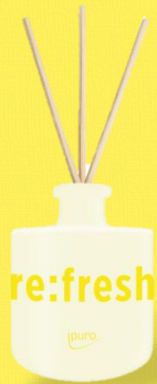
room fragrance WE ARE: ipuro re:fresh 100ml IC 6 / OC 6 IWA1001 / IWA2001