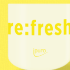
scented candle WE ARE: ipuro re:fresh 140g IC 6 / OC 6 IWA1201 / IWA2201

TOP CITRUS, LEMON, MANDARIN HEART FLORAL, FRUITY LILY OF THE VALLEY FOND WOODY, MUSKY AMBER, CEDARWOOD